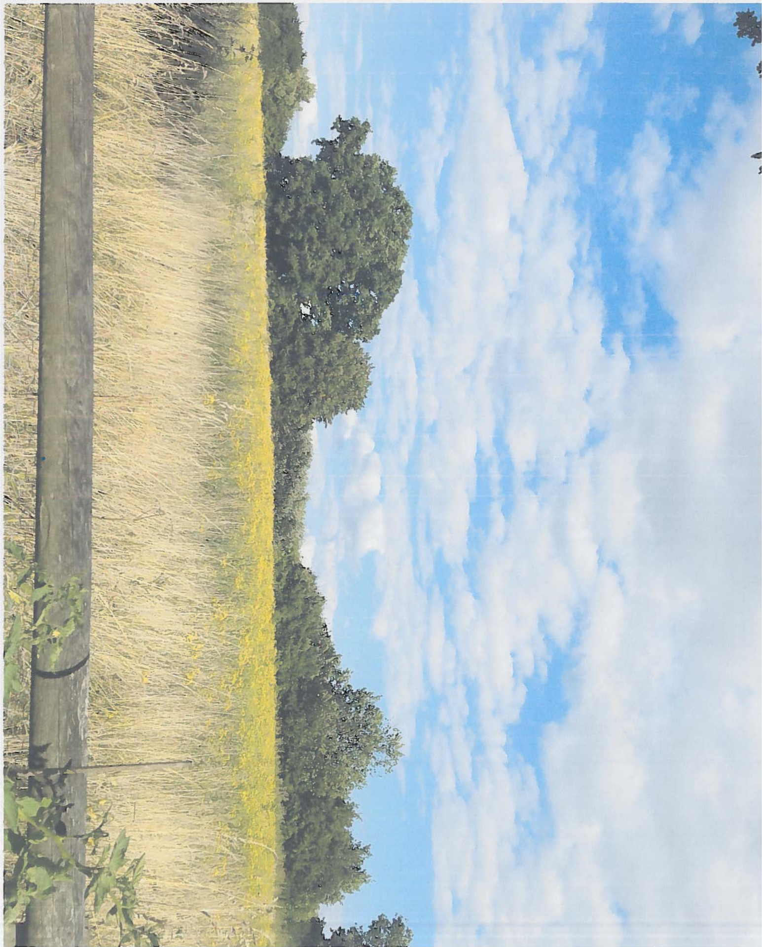
Collins Farm from my garden fence APPENDIX 2.