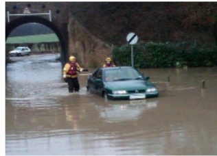
A woman being rescued from her car in Burnt House Lane, Ingatestone.

PUBLISHED: 11:35 18 January 2011 | UPDATED: 09:59 19 January 2011 | IAN WEINFASS