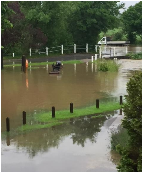
Above: Flooding on The Green – 2016