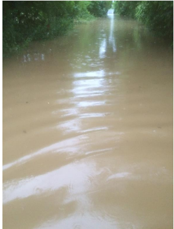
Above: Redrose Lane flooding - 23 June 2016