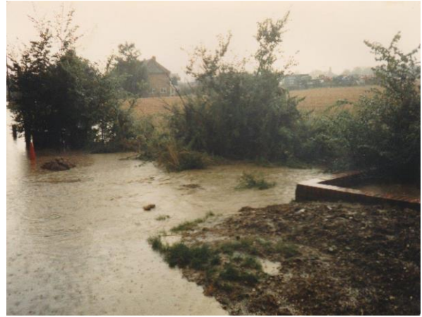
Above: Redrose Lane flooding - 1987