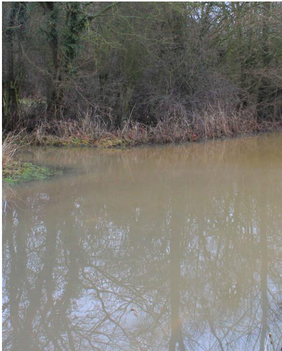
Above: Redrose Lane - March 2018