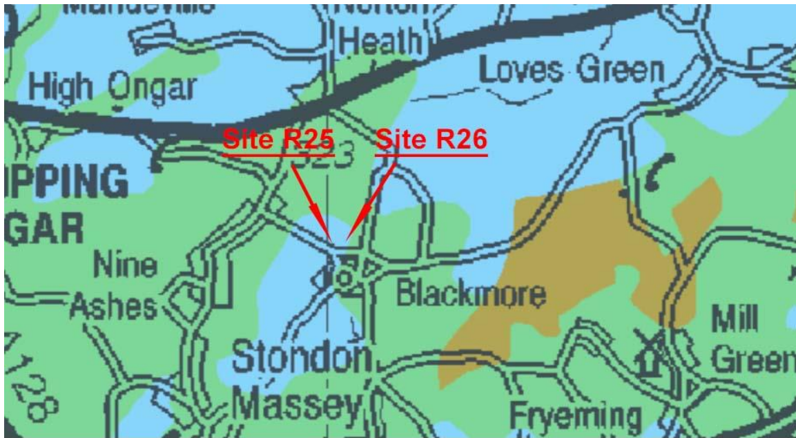
The Sites' Agricultural Land Classification (ALC008 - Eastern Region): Very Good (blue).