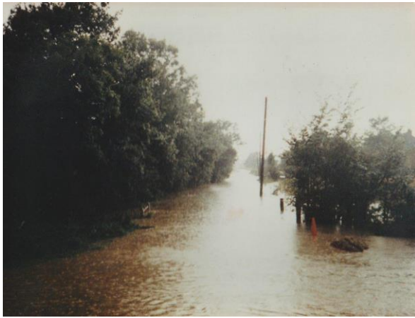
Above: Chelmsford Road flooding- 1987