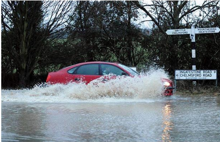
A car drives through flood water in Blackmore village, Essex