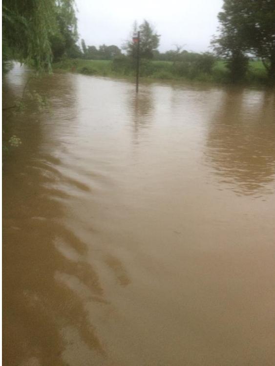
Above: Chelmsford Road flooding - 23 June 2016 (n.b. next to site R26)