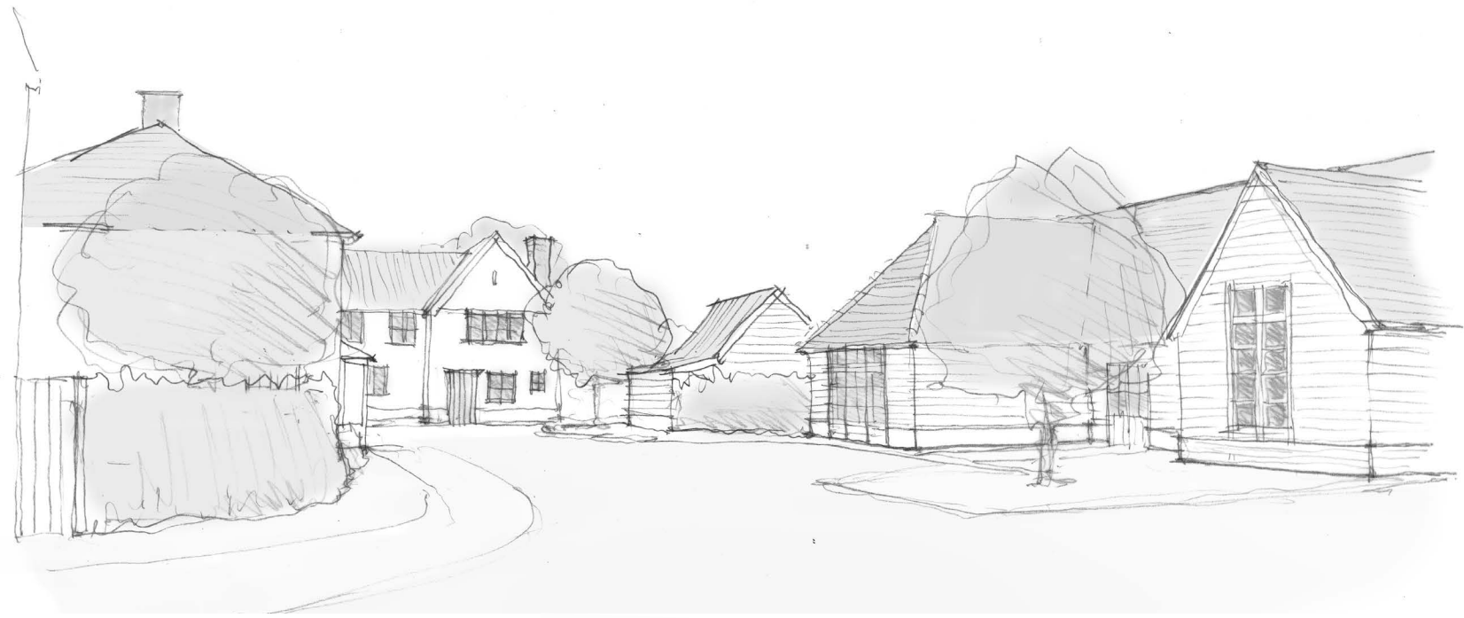
Sketch view looking North within potential development

DO NOT SCALE FROM THIS DRAWING EXCEPT FOR PLANNING PURPOSES. ANY DISCREPANCIES ARE TO BE REPORTED TO THE ARCHITECT. THE CONTRACTOR IS TO CHECK ALL BUILDING AND SITE DIMENSIONS PRIOR TO ORDERING MATERIALS OR CONSTRUCTION. THIS DRAWING IS TO BE READ IN CONJUNCTION WITH ENGINEERS' AND OTHER SPECIALISTS' DRAWINGS. COPYRIGHT REMAINS WITH THE ARCHITECT.