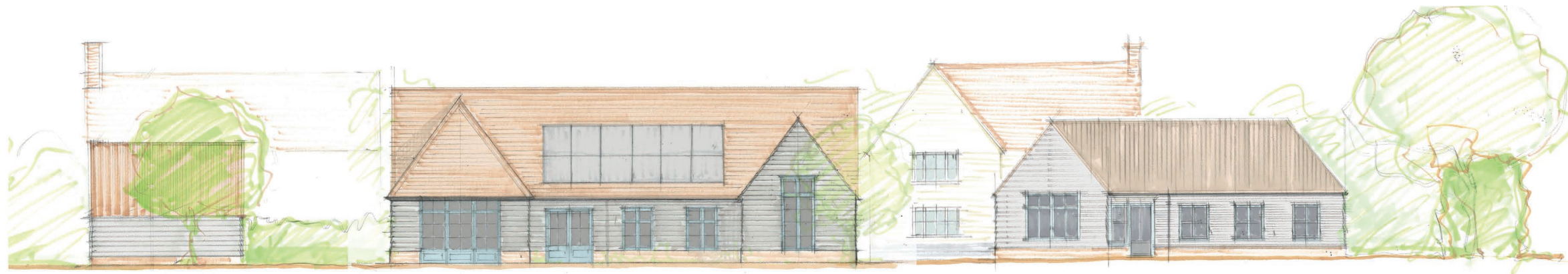
Sketch proposal looking East

DO NOT SCALE FROM THIS DRAWING EXCEPT FOR PLANNING PURPOSES. ANY DISCREPANCIES ARE TO BE REPORTED TO THE ARCHITECT. THE CONTRACTOR IS TO CHECK ALL BUILDING AND SITE DIMENSIONS PRIOR TO ORDERING MATERIALS OR CONSTRUCTION. THIS DRAWING IS TO BE READ IN CONJUNCTION WITH ENGINEERS' AND OTHER SPECIALISTS' DRAWINGS. COPYRIGHT REMAINS WITH THE ARCHITECT.