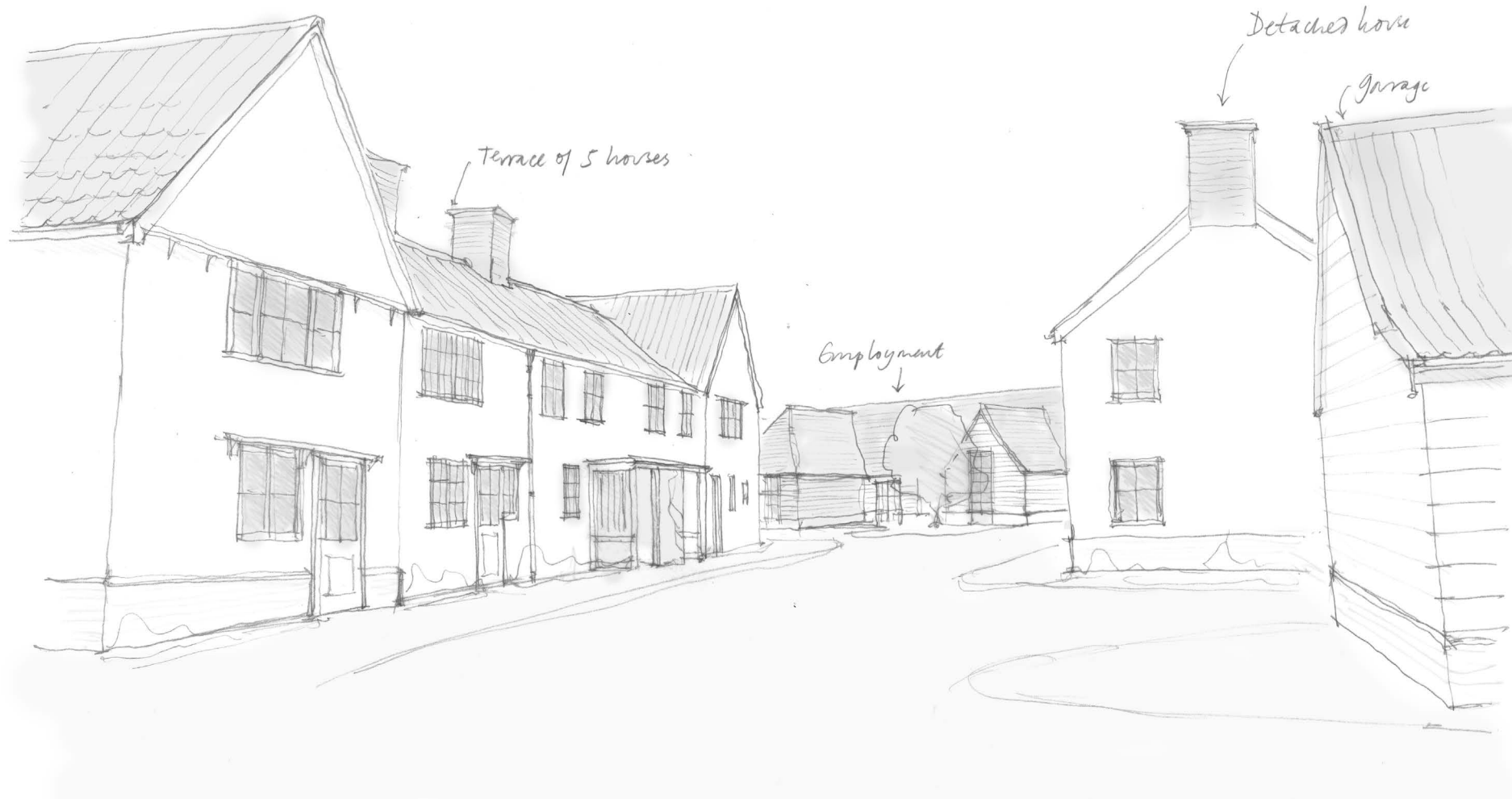
Sketch view looking East at entrance to potential development