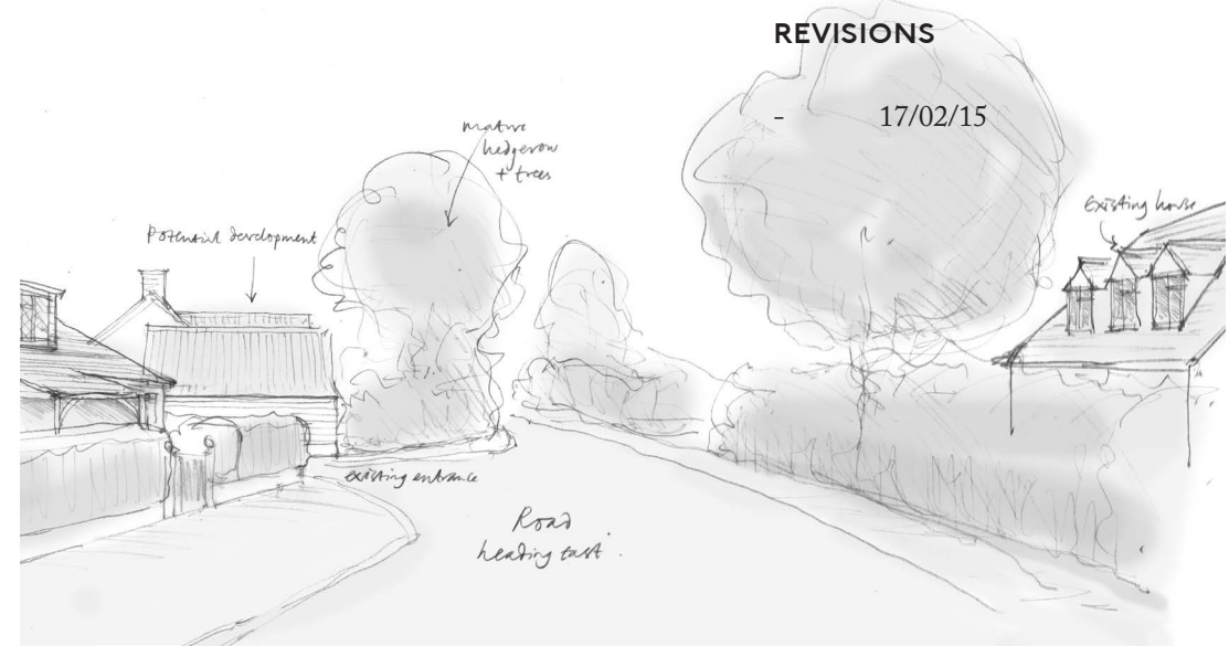
Sketch view looking East showing public view of potential development