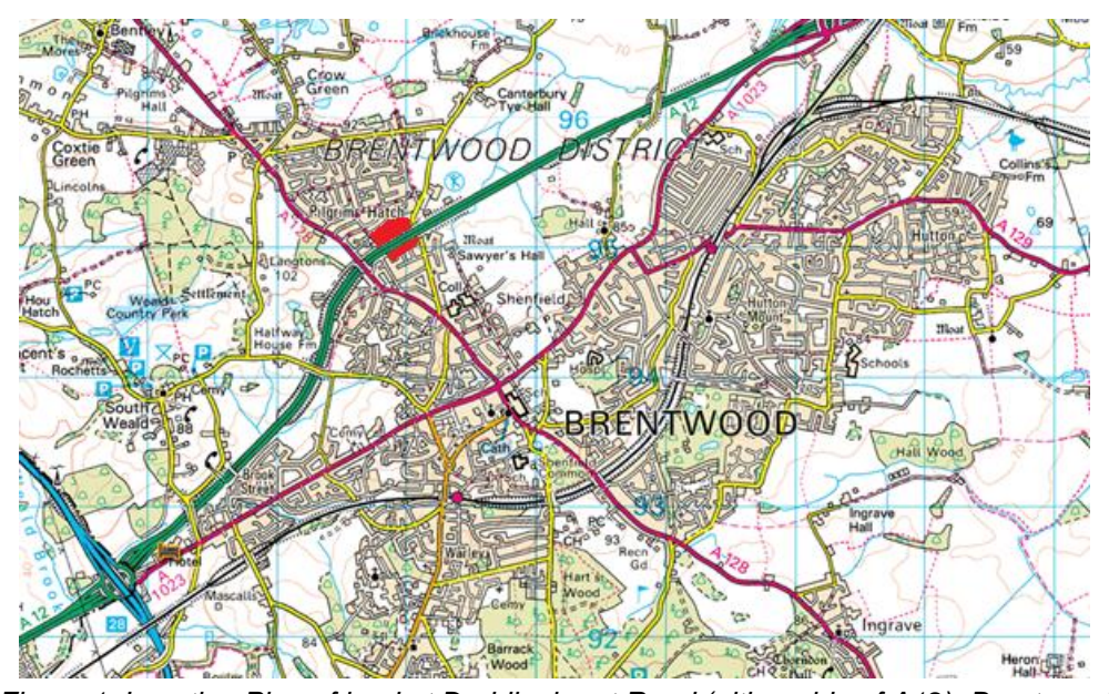
Figure 1: Location Plan of land at Doddinghurst Road (either side of A12), Brentwood

It is our view that land at Doddinghurst Road (either side of A12) is capable of fulfilling the role of a small scale urban expansion to Brentwood. The site comprises approximately 7.2 ha (full site plan shown in Appendix A) of greenfield land adjacent to the settlement boundary of Brentwood (as shown in Figure 1) and offers the ability to deliver 230-250 dwellings together with associated amenity and open space. It is bounded by residential development to the north, south, west and south east with commercial leisure to the north east; therefore would allow for a clear long term defenceable Green Belt boundary.