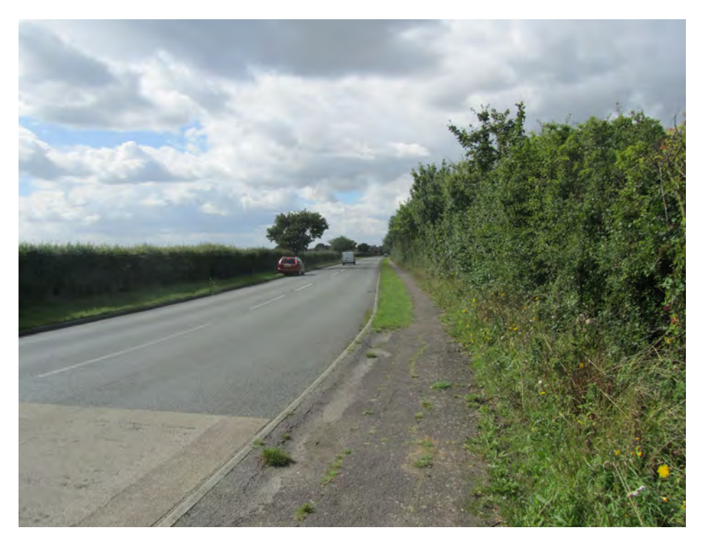
Viewpoint 3: View westwards from Station Road west of the junction with the A128, distance from east site approx 0m; distance from west site approx 1000m; 12m AOD.

The view looking westwards along Station Road is dominated by the road and a low clipped hedge. New housing would appear above the existing hedgerows on either side of the road. This would represent a moderate change in view. A strong landscape structure of additional woodland planting would maintain a rural approach to West Horndon and reduce the visual impact of the housing.