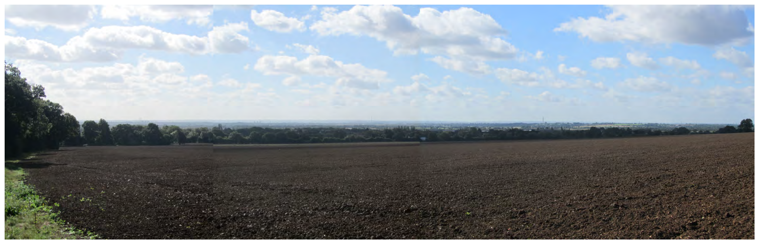
Viewpoint 7: View southwards from public footpath within Thorndon Country Park South, distance from east site approx 600m; distance from west site approx 1100m; 40m AOD.

This 90 degree open, panoramic view takes in the hills of Kent and the towers of London. However roadside planting on the A127 screens a large proportion of both sites. The roofs of houses at both sites would be visible in the mid-ground of the view however the change in view would be minor.