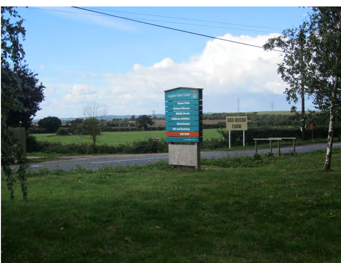
Viewpoint 16: View westwards from car park of Dunton Plotlands Nature Reserve, distance from West Site approx 3400m; distance from East Site approx 2500m; 15m AOD.

This northward looking view encompasses the Thorndon Country Park South to the north. The foreground of the view is dominated by Dunnings Lane which is enclosed by hedgerows which restrict the openness of the view. Neither site can be seen.