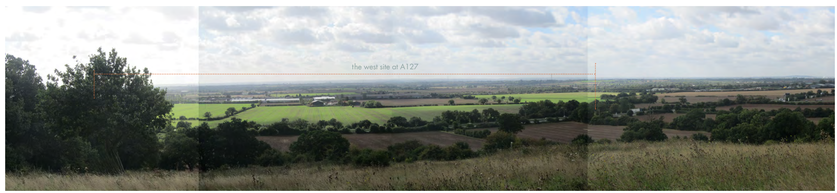
Viewpoint 9: View southwards from public footpath at Jury Hill within Thorndon Country Park South, distance from east site approx 900m; distance from west site approx 900m; 55m AOD.

Views of new housing at the east site would be blocked by existing vegetation on the hill slope south of the Thorndon Country Park South. Housing at the west site would be clearly visible and appear as a large block of housing in the centre of the view. It would be difficult to screen the new housing at the west site effectively.