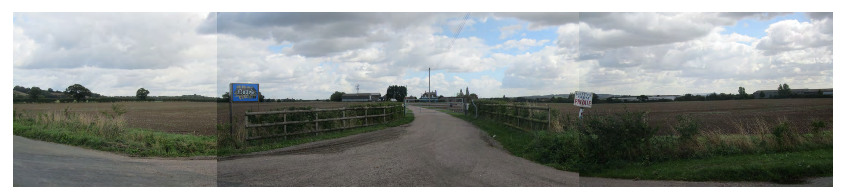
Viewpoint 10: View westwards from the junction of the entrance of Nuttys Farm and Childerditch Lane, distance from west site approx 0m; distance from east site approx 1100m; 15m AOD.

Views of new housing at the east site would be blocked by existing vegetation on the hill slope south of the Thorndon Country Park South. Housing at the west site would be clearly visible and appear as a large block of housing in the centre of the view. It would be difficult to screen the new housing at the west site effectively.