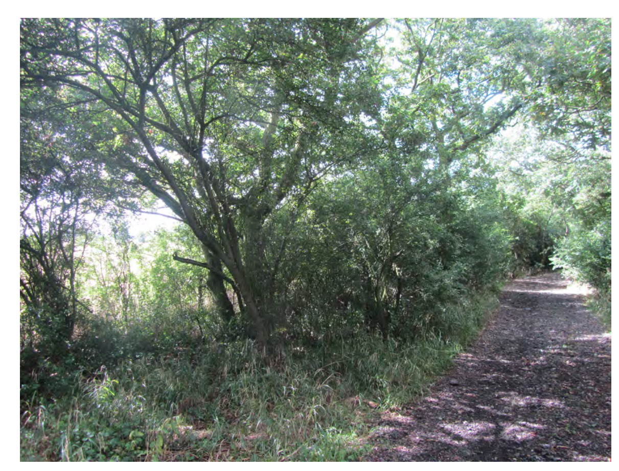
Viewpoint 13: View westwards from Byway to the east of A128 , distance from west site approx 1500m; distance from east site approx 500m; 20m AOD.

The view is highly enclosed by the lane's surrounding vegetation. No new housing would be visible at either of the sites.