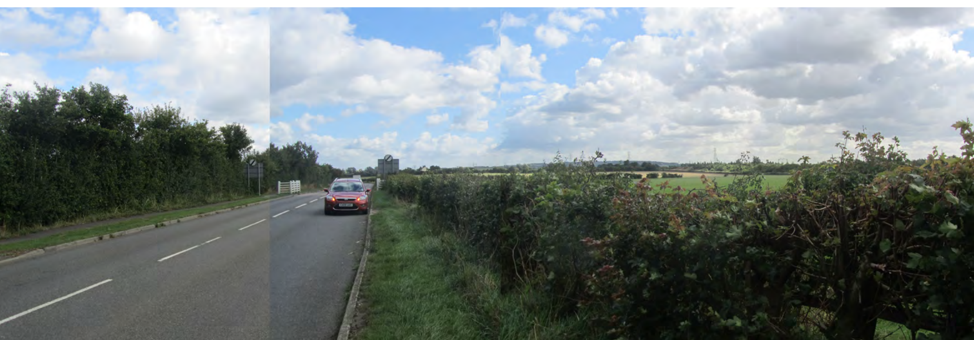
Viewpoint 4: View eastwards from Station Road east of West Horndon with the A128, distance from East Site approx 0m; distance from west site approx 600m; 10m AOD.

The view looking westwards along Station Road is dominated by the road and a low clipped hedge. New housing would appear above the existing hedgerows on either side of the road. This would represent a moderate change in view. A strong landscape structure of additional woodland planting would maintain a rural approach to West Horndon and reduce the visual impact of the housing.