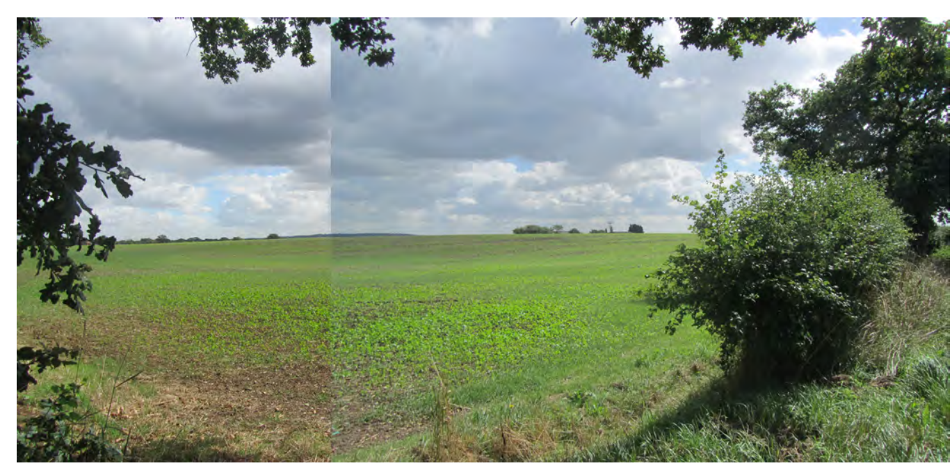
Viewpoint 1: View westwards from Childerditch Lane south of the A127, distance from west site approx 500m; distance from east site approx 1100m; 20m AOD.

Views to the east site are blocked by the vegetation associated with properties in West Horndon. The roofs of houses within west site would be visible. The change in the view would be relatively minor.