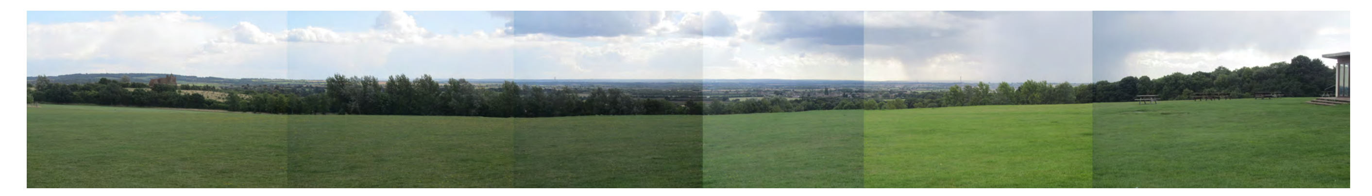
Viewpoint 6: View south from Octagon Plantation Country Park, distance from east site approx 700m; distance from west site approx 1500m; 50m AOD.

The east site can be seen in the mid-ground of the view. However the site forms only a small proportion of the overall view and is visually broken up by existing vegetation within the site. New houses would be visible however they would appear as a natural extension to West Horndon. In order to reduce the visual impact of the development, existing hedgerows should be maintained and planted with trees. Field 3 should be bisected by a new hedgerow and trees. Housing within the west site would be largely screened from view. The changes in the view would be minor.