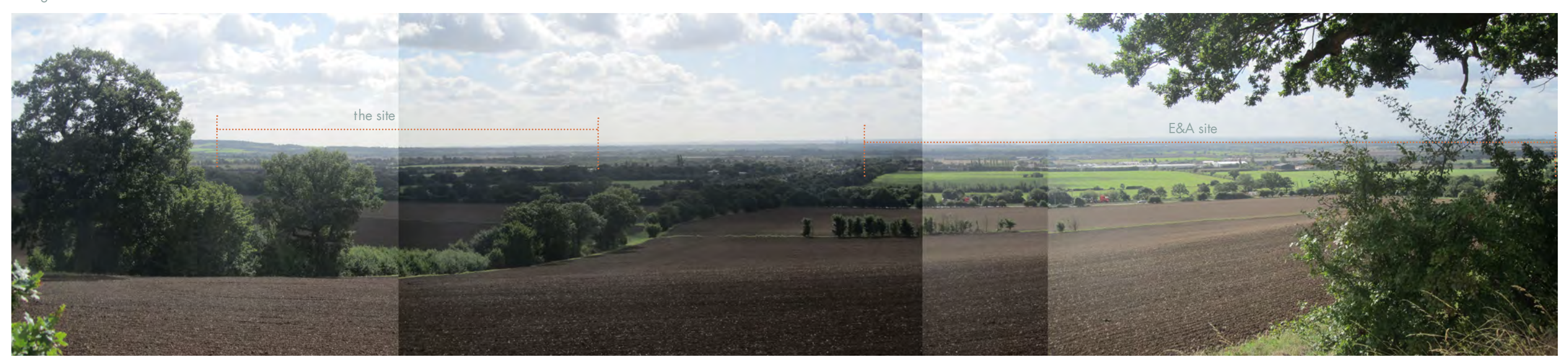
Viewpoint 8: View southwards from public footpath within Thorndon Country Park South, distance from East Site approx 800m; distance from west site approx 900m; 55m AOD.

This 90 degree open, panoramic view takes in the hills of Kent and the towers of London. However roadside planting on the A127 screens a large proportion of both sites. The roofs of houses at both sites would be visible in the mid-ground of the view however the change in view would be minor.