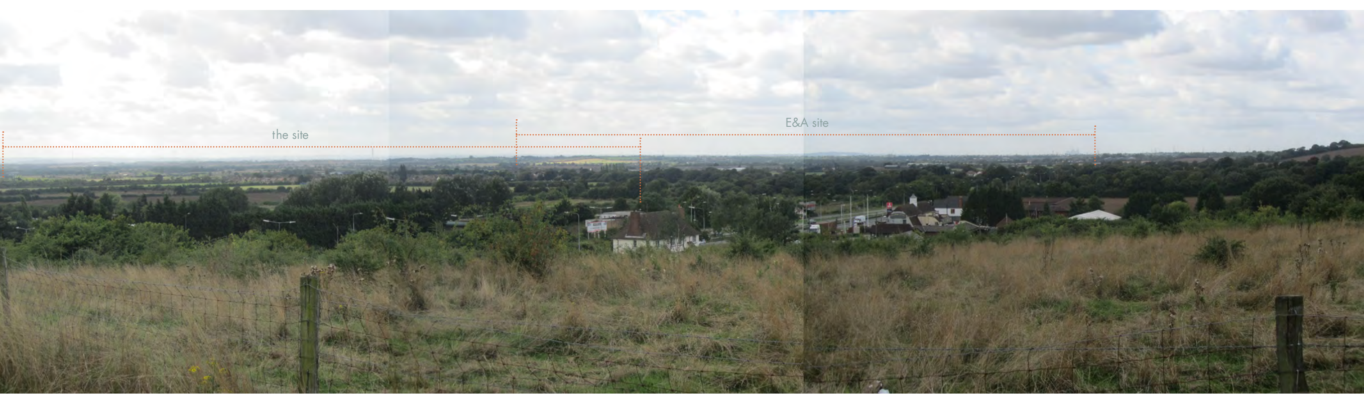
Viewpoint 2: View westwards from the Church of All Saints, north of the junction of the A127 and A128, distance from east site approx 600m; distance from west site approx 1400m; 45m AOD.

Views to the east site are blocked by the vegetation associated with properties in West Horndon. The roofs of houses within west site would be visible. The change in the view would be relatively minor.