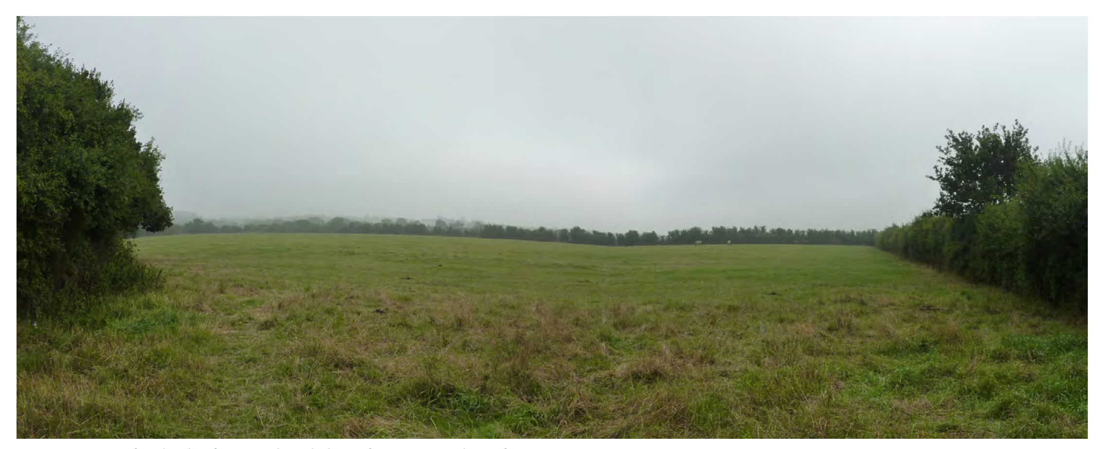
Viewpoint 5: View east from the edge of West Horndon Park, distance from east site 0m; distance from west site approx 1500m; 15m AOD.