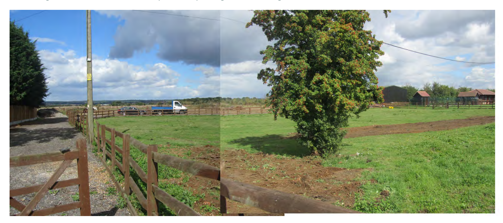
Viewpoint 12: View northwards from the footpath east of Blankets Farm , distance from west site approx 2500m; distance from east site approx 2600m; 5m AOD.

New housing at both sites would be almost entirely screened by existing off and on site vegetation.