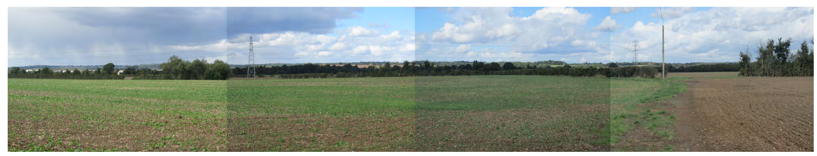
Viewpoint 11: View northwards from the footpath east of Field House, distance from west site approx 1000m; distance from East Site approx 800m; 8m AOD.

New housing at both sites would be almost entirely screened by existing off and on site vegetation.