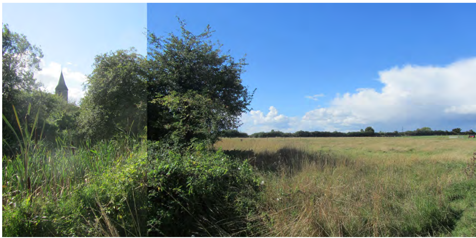
Viewpoint 14: View westwards from footpath east of church at Dunton Hall, distance from west site approx 2900m; distance from east site approx 1400m; 35m AOD.

The view is highly enclosed by the lane's surrounding vegetation. No new housing would be visible at either of the sites.