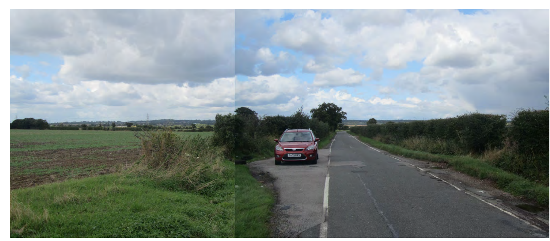
Viewpoint 15: View northwards from Dunnings Lane, distance from west site approx 1600m; distance from east site approx 2000m; 6m AOD.

This northward looking view encompasses the Thorndon Country Park South to the north. The foreground of the view is dominated by Dunnings Lane which is enclosed by hedgerows which restrict the openness of the view. Neither site can be seen.