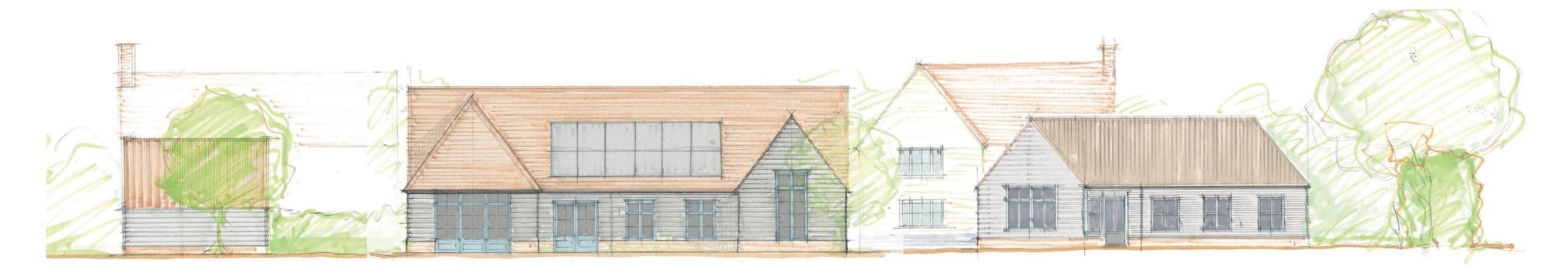
Sketch proposal looking East